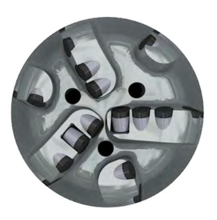
The i-MILL TT intervention mill is designed using the IDEAS platform to operate at the high-rotation speed of the Neyrfor TTT turbodrill. Cutter type is selected based on the material to be cleaned.